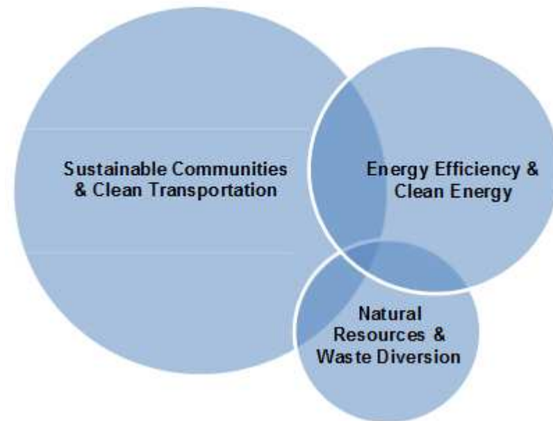
Figure 9 Investment Priorities –Recommendations